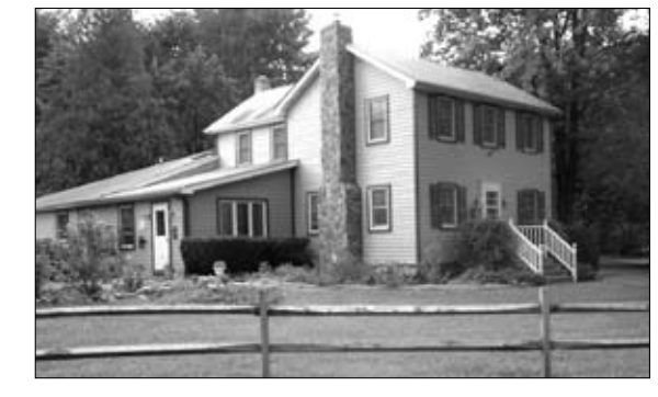
Chestnuthill Bed & Breakfast