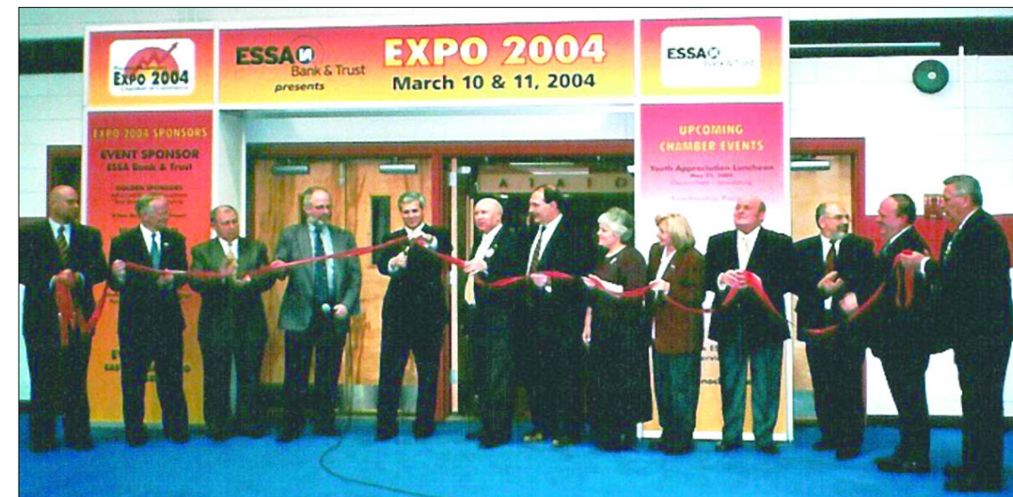
EXPO 2004 Ribbon Cutting