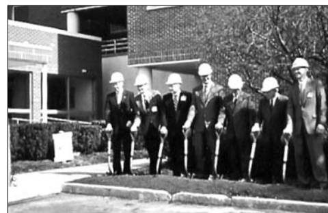
Pocono Medical Center broke ground on a new cardiac care facility.

The Pocono Environmental Education Center will offer workshops and events for this month, including a Leap Into Spring