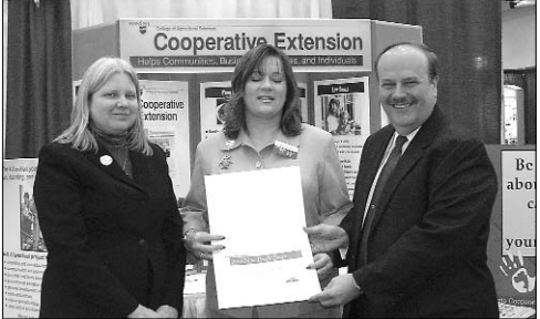
Best Non-Profit Penn State Cooperative Extension of Monroe County