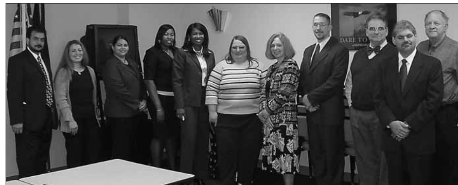
A special thanks to EA Wedding Planner for sponsoring the breakfast.

The Hypnosis and Longevity Center , located in Village Park Center in Pocono Lake offers hypnosis for weight management, smoking, sleep improvement, and stress reduction. This is offered through retraining of the brain waves so the client can self manage their challenges. Visit them today or give them a call at (570) 646-2278.