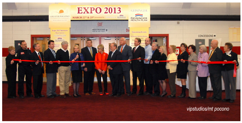
Ribbon Cutting at Expo 2013

The Greater Pocono Chamber of Commerce's Expo was held on March 22 and March 23 at East Stroudsburg University's Koehler Field House. Geisinger/Geisinger Health Plan was, once again, the major sponsor. PPL sponsored the VIP Reception, which gave guests and exhibitors an opportunity for networking.