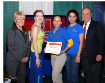
Most Interactive Booth - Best Buy