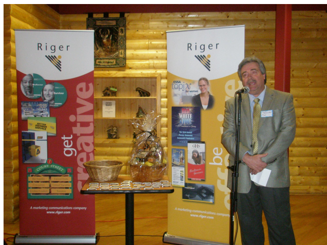
Riger, A Marketing/ Communications Firm - Sponsor o