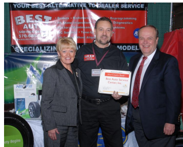
Most Creative Booth - Best Auto Service Center