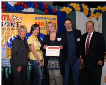
Best in Show - Nassau Broadcasting