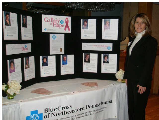
Blue Cross of Northeastern Pennsylvania - Sponsor

For more information on upcoming WIB lunches, to donate a door prize, or to sponsor a luncheon, please contact Miriam Conway at 570.421.4433.