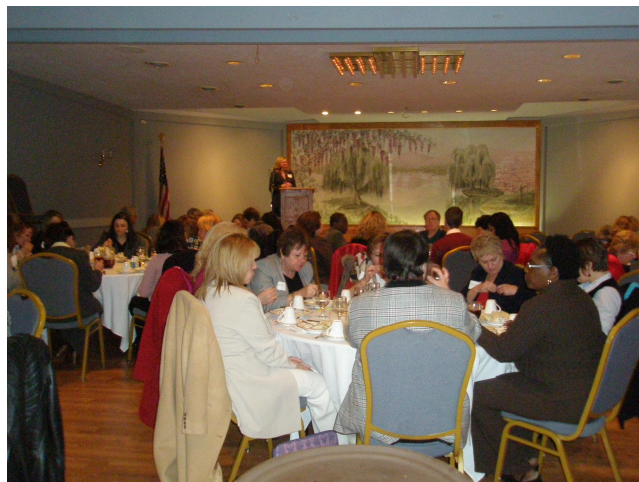
Women in Business Luncheon at the Sycamore Grille