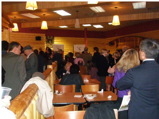
Networking at the Log Cabin Bar & Grill

The Log Cabin Bar & Grill located in the Crossings Premium Outlets in Tannersville hosted the March Business Card Exchange. This restaurant is the perfect place to have lunch or dinner, while shopping at the outlets. They are located in Building G02, next to Carter's and have a great selection of delicious food that will please anyone's appetite.