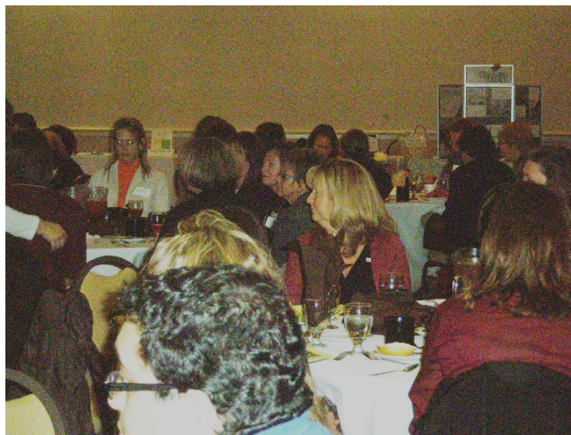
November Women in Business Luncheon at the Chateau Resort & Conference Center

Vendors that showcased their products were: AlignLife, Best Buy, Comprehensive Family Practice, Elevations Health Club, Mary Kay, Griswold Special Care, Home Instead Senior Care, No Limits Personal Trainer, Oakwood Terrace, Organa Gold Coffee, Pocono Medical Center, Quality Health Care, Riverside Rehabilitation, and Shawnee Ridge Senior Living.