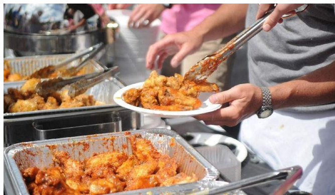
Wing Off at Meals on Wheels

Meals on Wheels also relies heavily on volunteer help and is seeking 50 volunteers for this year's Wing Off. Volunteers will work in two shifts, either 11:30am - 2:00pm or