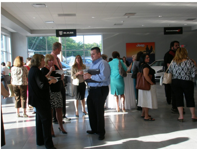
Networking at Gray Chrysler Dodge Ram Jeep

For reservations, please contact the Chamber at 570.421.4433.