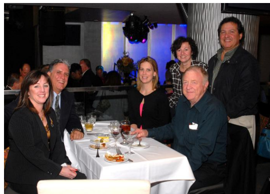
Membership Appreciation at Mt. Airy Casino

Mount Airy Casino Resort hosted the Greater Pocono Chamber of Commerce Membership Appreciation Party on Monday, May 10. Over 200 members were in attendance to take advantage of the opportunity to network and sample an array of delicious hors d'oeuvres. Several members also tried their luck at the slot machines, hoping to hit the jackpot!