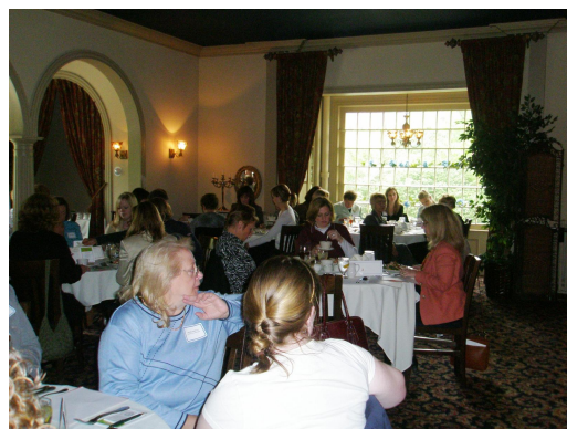
Women in Business Luncheon at Meadowbrook Inn