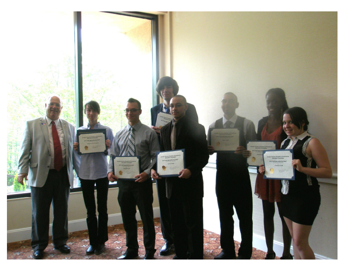
2013 Youth Appreciation Award Winners

Youth Appreciation Day recognizes students who have overcome significant challenges to achieve success. They are awarded based on their overall accomplishments and they are not the top athletes or scholars.