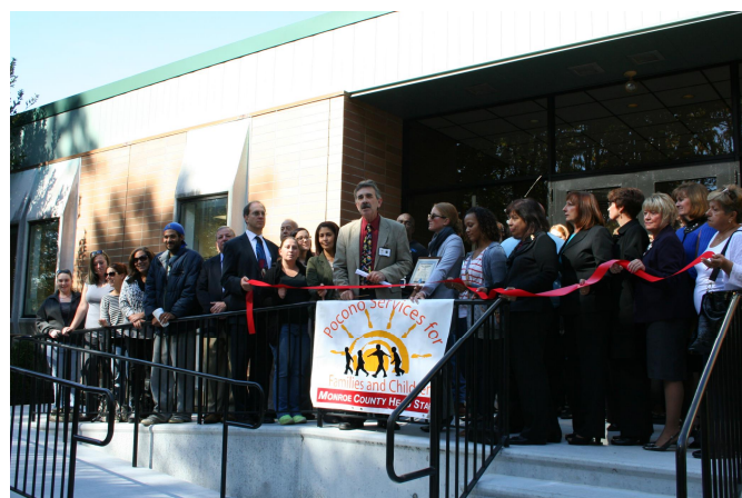
Pocono Services for Families & Children 212 W. 4th Street East Stroudsburg, PA 18301 570-421-2711