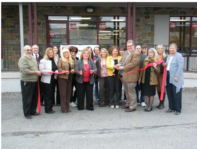
CDE Career Institute 1644 Route 611, Pocono Creek Plaza Tannersville, PA 18372 570-629-2690