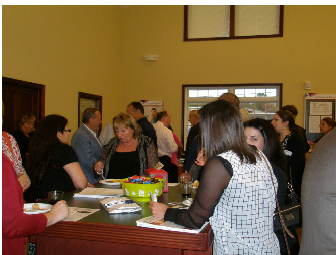
Networking at First National Bank of PA

Food was provided by Dickey’s Barbecue Pit. The beverages and dessert was provided by local businesses.