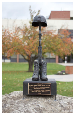
"Tribute to the Troops" in Veterans Plaza on Northampton's Main Campus in Bethlehem