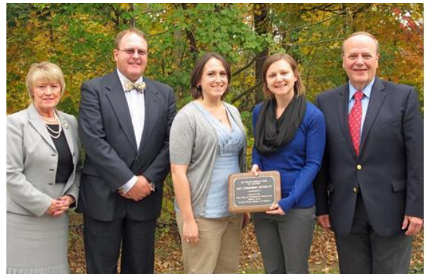
2013 Healthy Workplace Award East Stroudsburg University - Recipient

The purpose of the Healthy Workplace Awards is to recognize companies that are adopting and continuing wellness programs in their workplace.