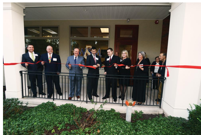
Wealth Strategies & Management, LLC 907 Main Street, Suite 102 Stroudsburg, PA 18360 570-424-1555