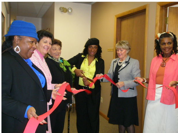
African American Network 556 Main Street Stroudsburg, PA 570-588-5065