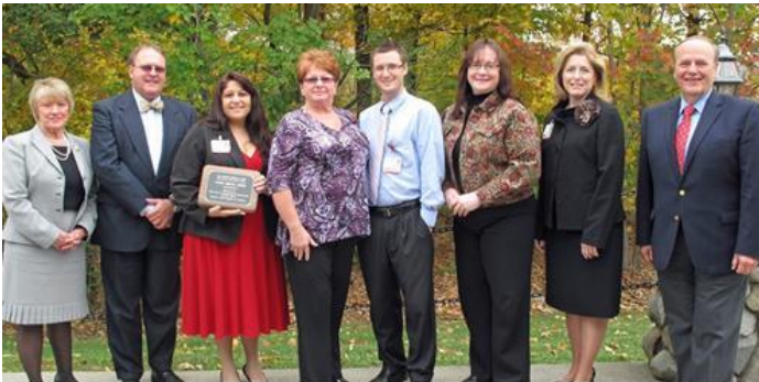
2013 Healthy Workplace Continuing Excellence Award Pocono Medical Center - Recipient

The 2013 Healthy Workplace Awards luncheon was held on Wednesday, October 22, 2013 at Ridgcrest at Stroudsmoor and was sponsored by the Greater Pocono Chamber of Commerce, Blue Cross of Northeastern Pennsylvania, and ChamberChoice.