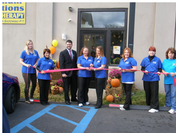
Maximum Solutions Physical Therapy 66 S. Courtland Street - #101 East Stroudsburg, PA 18301 570.420.0606