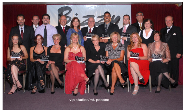
2008 Bizzy Award Recipients