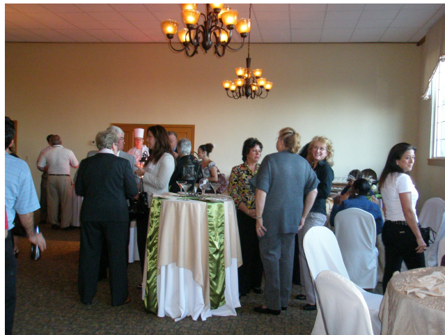
September Business Card Exchange at Inn at Pocono Manor

AWESOME, is the best word to describe the September Business Card Exchange that was hosted by the Inn at Pocono Manor. What an outstanding array of food and beverages that were compliments of the Inn. For information on what the Inn at Pocono Manor offers, contact them today at 570-839-7111.