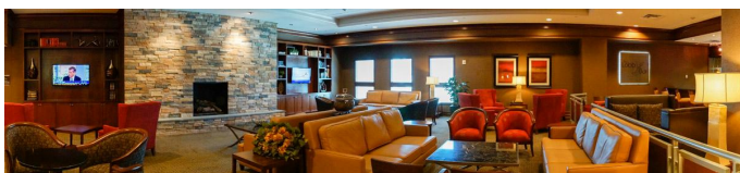
The Lobby Bar at Bushkill Inn

When the time comes for dining, be it a light bite to eat or