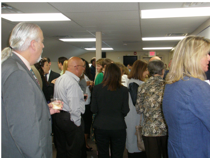
Business Card Exchange at Pocono Pistol Club

Pocono Pistol Range , located at 85 N. First Street in Stroudsburg, hosted the September Business Card Exchange. Everyone in attendance had an opportunity to see what Pocono Pistol has to offer, sample outstanding hors d'oeuvres, network with fellow Chamber members, and also received a certificate for one hour of range time. If you are looking to visit the facility or possibly make a purchase, call them today at 570-424-2940. You can also visit their website at www.info@poconopistolclub.com .