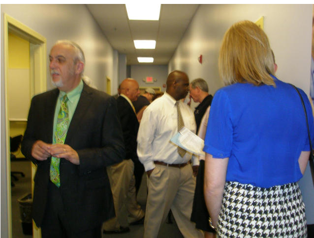
Networking at Wilkes University

Wilkes University, which is located at the Shoppes at Crossroads in Bartonsville, offers programs for working adults. The offer Adult Bachelor of Administration, Masters of Business Administration, and Master of Science in Engineering Management. They are also partnering with the American Payroll Association (APA) to offer continuing education courses for payroll professionals.