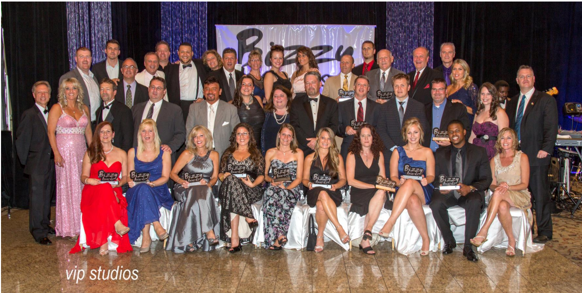
2013 Bizzy Awards Winners with family and friends

The 8th Annual Bizzy Awards was held on Thursday, September 12 th at the Chateau Resort & Conference Center in Tannersville. Awards were given in 12 categories and over 260 people were in attendance.