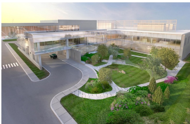
R. Dale & Frances Hughes Cancer Center

A newly established PHF fund will help breast cancer patients at the R. Dale & Frances Hughes Cancer Center