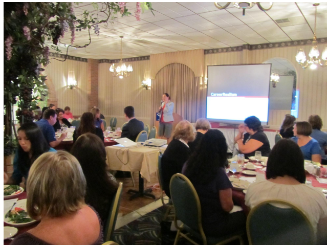
Women in Business Luncheon at Peppe's Bistro