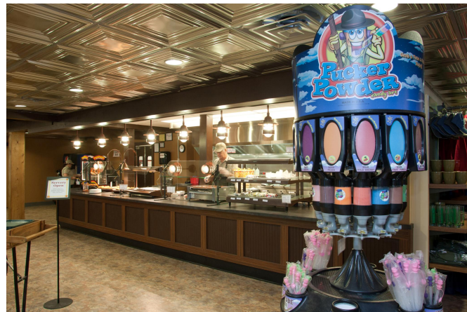
Newly Renovated Food & Beverage Facility at Bushkill Falls

Bushkill Falls , known as "The Niagara of Pennsylvania", and one of the Pocono Mountains' most famous attractions, has completed an $ 800,000 renovation to its food and beverage facility as well as the gift and souvenir shop.