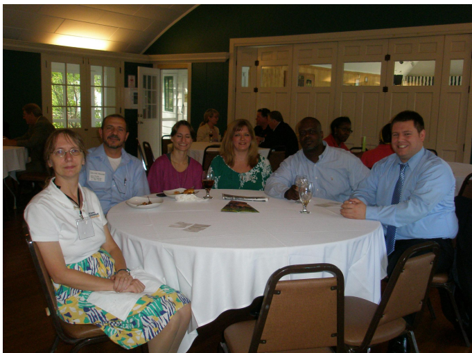
Business Card Exchange at Buck Hill Falls

Buck Hill Falls Company hosted the August Business Card Exchange. Not only did everyone enjoy the delicious array of food that was presented, they also enjoyed sitting outside overlooking the tennis courts. Buck Hill Falls has so much to offer, and the public can take advantage of their amenities. For more information on Buck Hill Falls contact them at 570-595-7511 or visit their website at www.buckhillfalls.com