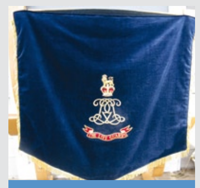
ABOVE Music Stand Banner, The Life Guards RIGHT Regimental Side Drum, The Blues and Royals

Members of the Household Cavalry are first and foremost professional soldiers. When not performing their mounted ceremonial duties, they are serving in armoured units at home and abroad. They have fought in all the major wars for over 300 years.