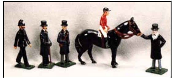
“The Silver Blaze” by Charles Hall.

About 20,000 subscriptions to The Strand Magazine were canceled. Protest rallies were held in New York City in the United States and on London’s Fleet Street in England. Conan Doyle received piles of angry letters in his mailbox.