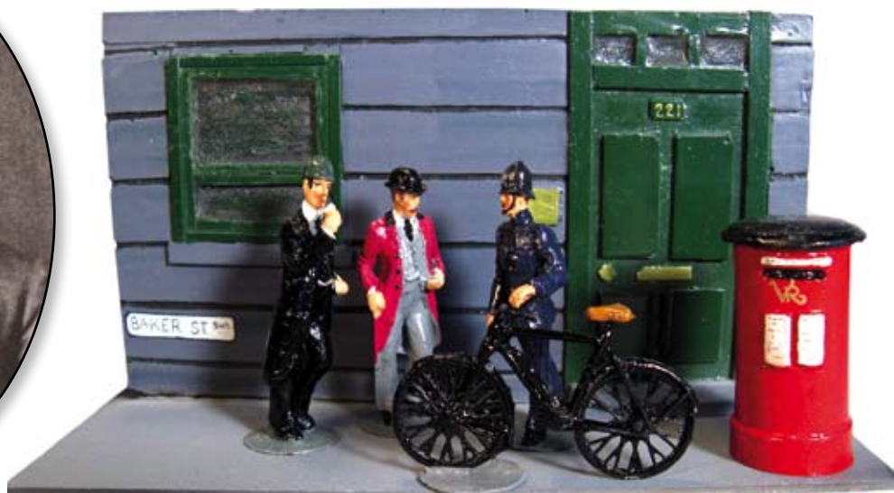
Holmes and Watson with a Bobby outside the detective's London lodgings at 221B Baker St. by Little Lead Soldiers.