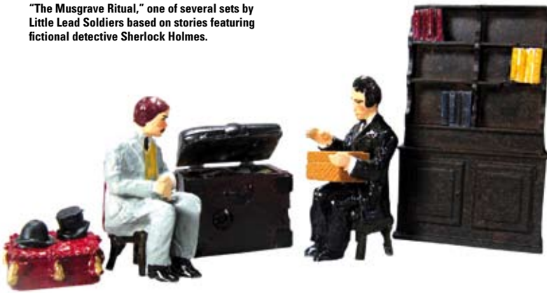
"The Musgrave Ritual," one of several sets by Little Lead Soldiers based on stories featuring fictional detective Sherlock Holmes.