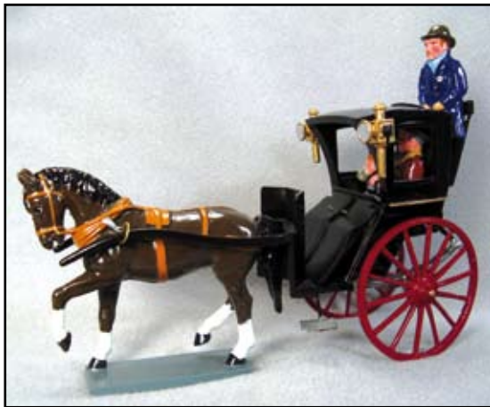
"Holmes & Watson in a Hansom Cab" by Trophy Miniatures.