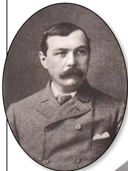
Sir Arthur Conan Doyle wrote four novels and 56 short stories featuring Sherlock Holmes.