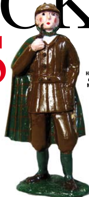
Sherlock Holmes in 54-mm scale by Marlborough Military Models.