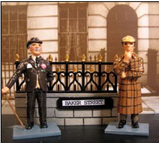
Watson and Holmes on Baker Street by Trophy Miniatures.

One illustration pictured the detective with his hand clapped to his brow, a look of the utmost concentration on his features, standing on a pebbled beach, considering the stones that lay around him -- millions and millions of them, as far as the eye could see. The artist's caption was, "Portrait of a celebrated detective regretting his rash decision to leave no stone unturned."