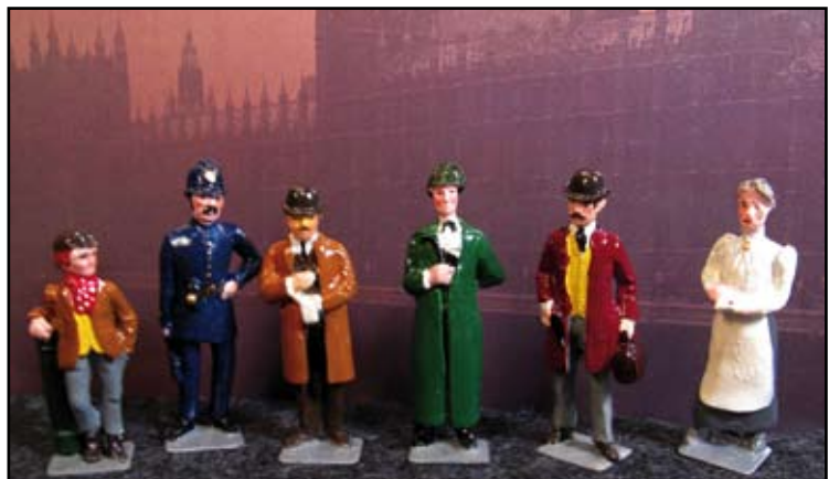
Holmes and friends group by Little Lead Soldiers.