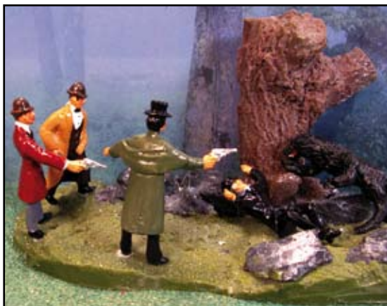
"The Hound of the Baskervilles" by Little Lead Soldiers.