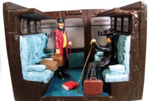
“The Final Problem” by Little Lead Soldiers.