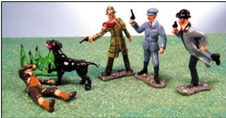
"The Hound of the Baskervilles," a 54-mm set by Sarum Soldiers.

Conan Doyle invented an amateur detective, basing many of the literary character's characteristics on Dr. Joseph Bell, for whom he had worked as a clerk at the Edinburgh Royal Infirmary. Dr. Bell had an uncanny way of pinpointing details about a patient through careful observation. In fact, he could learn more this way than others might through exhaustive questioning. Dr. Bell even helped police solve a few crimes.