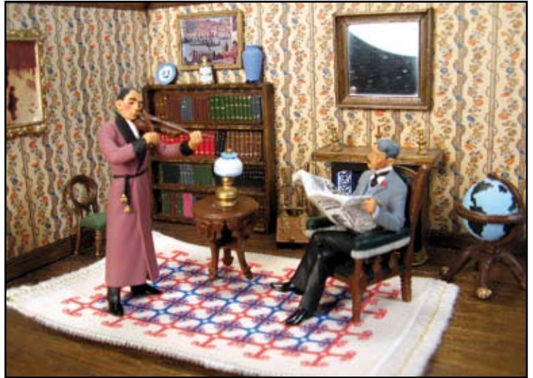
221B Baker St. by Phoenix Models.

The immortalized Holmes lived on in parody and burlesque.