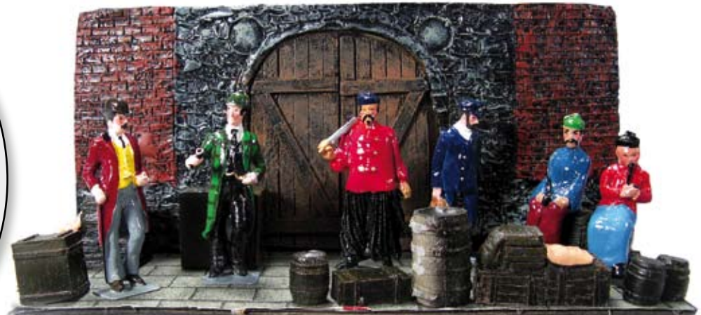
Little Lead Soldiers set depicting London's Limehouse Docks, the setting for Holmes' visit to an opium den in "The Man With the Twisted Lip."