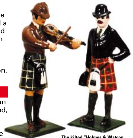
The kilted "Holmes & Watson in Edinburgh" by Charles Hall.

It's certainly no mystery why an icon like Sherlock Holmes is so collectible in toy figure form. ■