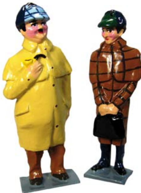
The comic team Laurel and Hardy as Holmes and Watson by Unicorn Miniatures.

Running as a Liberal Unionist during the early 20th century, Conan Doyle unsuccessfully sought election to Parliament twice -- once in Edinburgh and another time in Scotland's Hawick Burghs constituency.