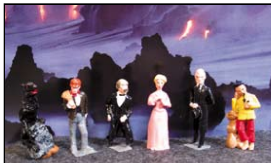
Moriarty and other villains figures by Little Lead Soldiers.

The creator of Sherlock Holmes was Sir Arthur Conan Doyle. Born in Edinburgh, Scotland, in 1859, he studied medicine as a young man. But Conan Doyle found the practice of medicine financially unremunerative. At age 27, he turned his attention to writing novels as a way to make money.