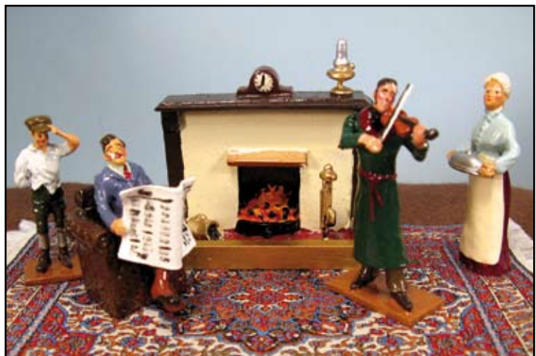
Baker Street set by Sarum Soldiers.

Conan Doyle wrote a total of four novels and 56 short stories about Holmes. The last of the stories was published in 1927, three years before the author's death.