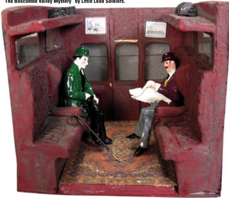
▶ "The Boscombe Valley Mystery" by Little Lead Soldiers.