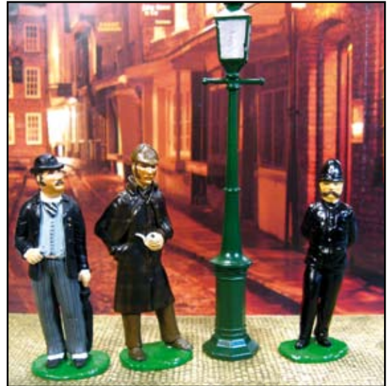
Watson, Holmes and constable by Valiant Miniatures.

“ Conan Doyle mulled over what to name his key characters. ‘Sherrinford Holmes’ was an early idea, with ‘Ormond Sacker’ for his sidekick, ” Dr. John H. Watson!