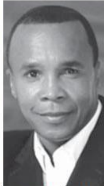
Sugar Ray Leonard