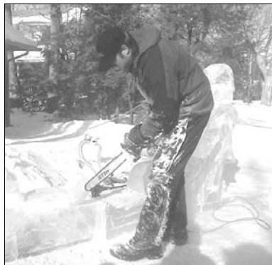
An artist from IceWorks sculpts a dog team out of blocks of ice.