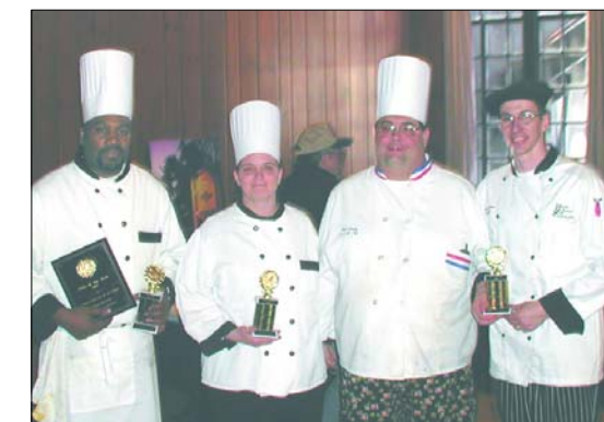
Dish of the Year for the 2004 Culinary Celebration of the Poconos went to The Blakeslee Inn.