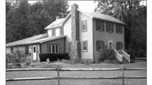
Chestnut Hill Bed & Breakfast