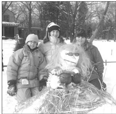
Girl Scouts from Troop 176 of the Scranton Pocono Council (shown) and others participated in a snowman-building contest.