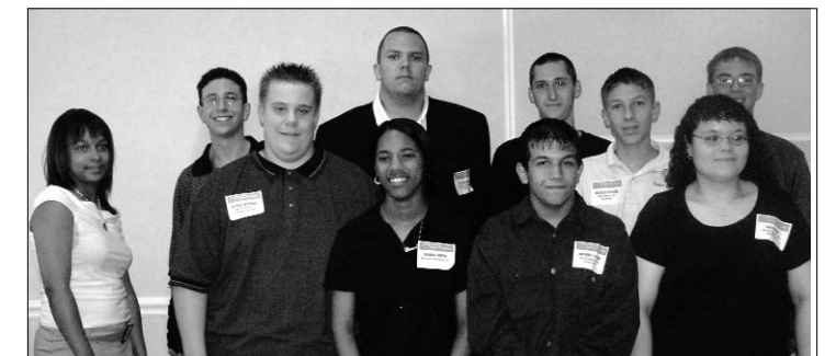
2004 Youth Appreciation Day Recipients

The honorees received gifts donated by Access Office Electronics, Bushkill Falls, Citizens Bank, Citizens Savings Association, ESSA Bank & Trust, First National Bank of Palmerton, Keystone Nazareth Bank & Trust, Loews Cineplex-Stroud 7, M&T Bank, North Penn Bank, Odd-Lot Outlet, Inc., Penn Security Bank & Trust Co., Pennstar Bank, PNC Bank, Pocono Community Bank, Pocono Family YMCA, Pocono Record NIE, and Wayne Bank. A special thanks to everyone who sponsored a lunch(s) for the students and their parents.