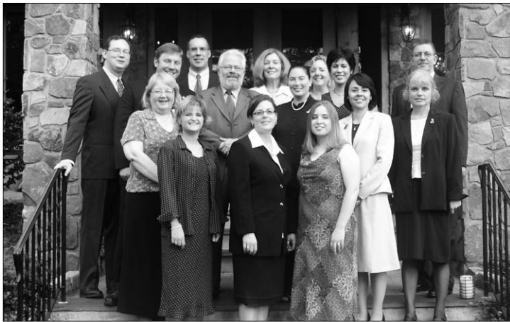
Leadership Pocono Graduating Class of 2004