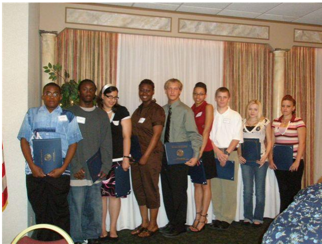
Youth Appreciation Day Award Recipients

Youth Appreciation Day recognizes students who have overcome significant challenges to achieve success. They are awarded based on their overall accomplishments and they are not the top athletes or scholars.