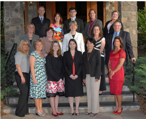
Leadership Pocono 2008 Graduates

On June 19, 2008, Leadership Pocono, Inc, a sole-owned subsidiary of the Greater Pocono Chamber of Commerce celebrated the graduation of our tenth class. Twenty individuals, surrounded by