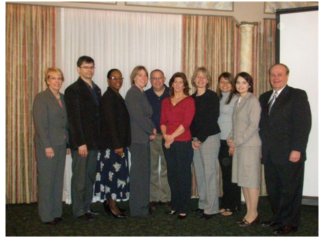
Leadership Pocono Class of 2008

As they travel on throughout the year, each month a full day session is held. The curriculum is intense as every aspect of leadership is covered, from communication to finance to writing a full strategic plan, as a team, for a fictional non-profit or business.