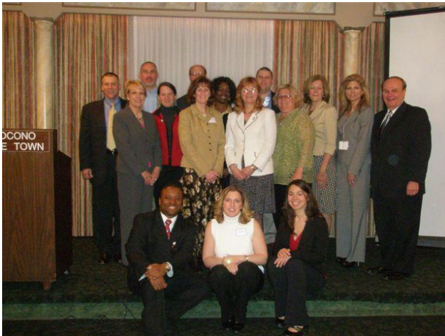
Leadership Pocono Alumni & Board