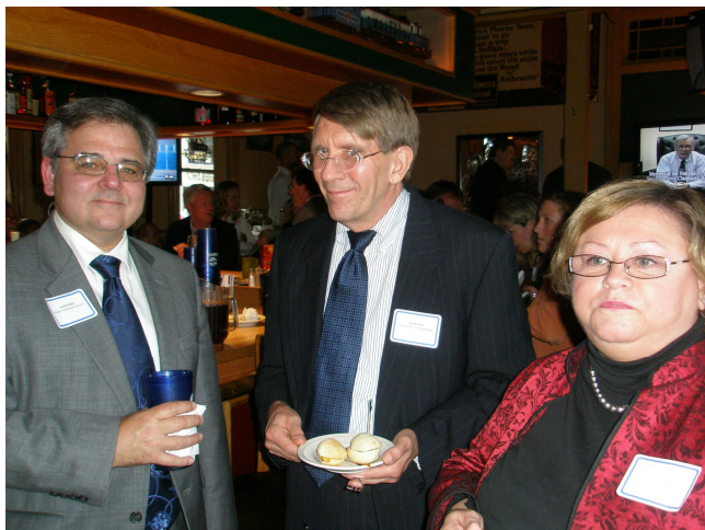
October Business Card Exchange at Dansbury Depot

The Business Card Exchange was held at the Dansbury Depot on October 5, 2009 and was very well attended with over 100 guests. Dansbury Depot provided an outstanding array of appetizers along with a pig roast.