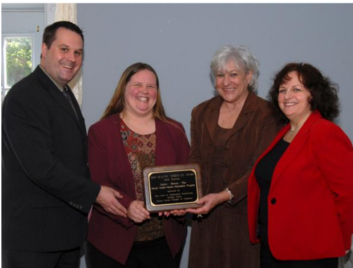
Award winner Carbon, Monroe, Pike MH/MR

Small Business (49 and under employees): Carbon, Monroe, Pike Mental Health/Mental Retardation Program , Large Business (50 and over employees): Shawnee Inn and Golf Resort . When asked, "What is your organization doing to promote a healthy workplace?"