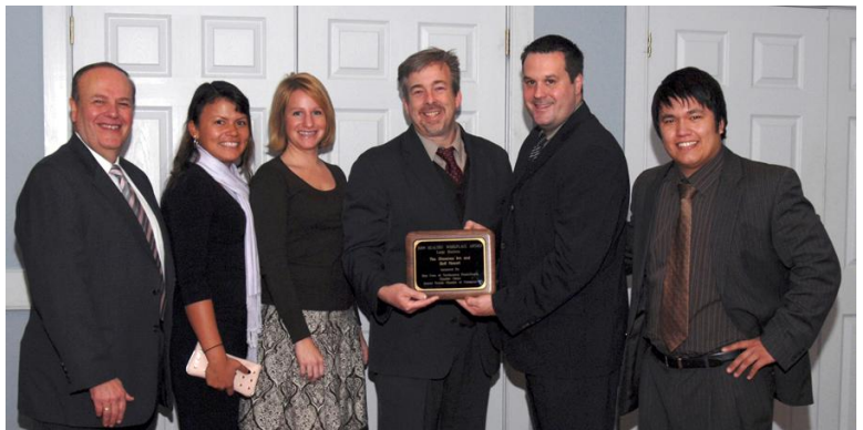
Award winner Shawnee Inn & Golf Resort

Shawnee Inn & Golf Resort reported that their employees can use Shawnee's indoor pool, tennis courts, and fitness center at no cost, along with hiking the trails, on and along the resort. They also receive employee discounts on the following amenity services; River Adventures, Shawnee Mountain, Golf, and Spa. Their employees can also take part in wellness activities such as 5K's and walks. Shawnee Inn is searching ways in which to partner with its health care provider to offer discount incentives for employees who join health clubs and smoking cessation programs. Shawnee Inn will continue to sponsor smoking cessation programs that the employees can join at no costs. In the event they complete the program, they are awarded with a $50 gift card. Both of these businesses need to be commended on their wellness programs that they have in place for their employees.