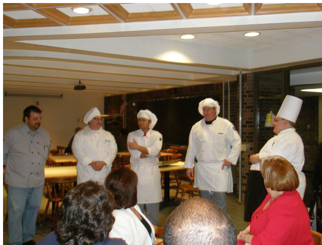
Welcome Wednesday at Monroe Career & Technical Institute